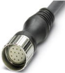
M23 socket, straight, 12-pos., with 10 m master cable, pin 9 and 10 bridged

Please be informed that the data shown in this PDF Document is generated from our Online Catalog. Please find the complete data in the user's documentation. Our General Terms of Use for Downloads are valid ( http://phoenixcontact.com/download )