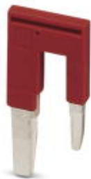
Reducing bridge, Number of positions: 2, Color: red

Please be informed that the data shown in this PDF Document is generated from our Online Catalog. Please find the complete data in the user's documentation. Our General Terms of Use for Downloads are valid ( http://phoenixcontact.com/download )