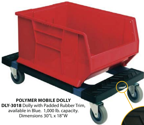
POLYMER MOBILE DOLLY DLY-3018 Dolly with Padded Rubber Trim, available in Blue. 1,000 lb. capacity. Dimensions 30" L x 18" W

ATTACHED PULL RING allows dolly to be pulled with ease