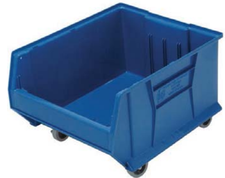
MOBILE HULK CONTAINER Ideal for transport of heavy and bulky parts. Bin comes with 4 swivel, 3" casters, all with brakes, allowing up to 250 lb. mobile load capacity

AL-23 2" x 3-1/2" Adhesive clear label holder & inserts. Package of 24 (Sold separately)