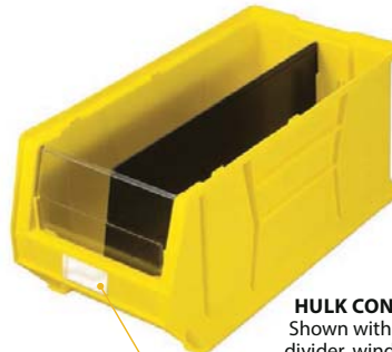
HULK CONTAINER Shown with optional divider, window front, adhesive label holder and insert

AL-23 2" x 3-1/2" Adhesive clear label holder & inserts. Package of 24 (Sold separately)