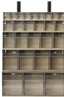
Utilize rails when base of the first bin will sit on the floor