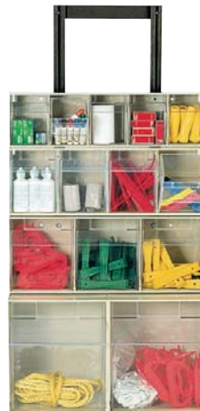
Utilize frame when bins will be mounted above floor level