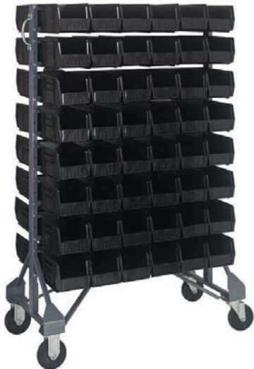
QRU-16DCO + QRU-MOBSCO Shown with 96 QUS230CO (Bins sold separately)