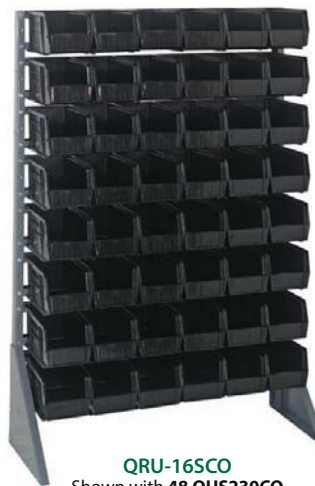
QRU-16SCO Shown with 48 QUS230CO (Bins sold separately)