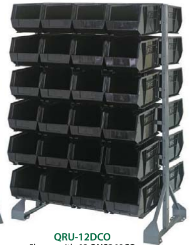
QRU-12DCO Shown with 48 QUS240CO (Bins sold separately)