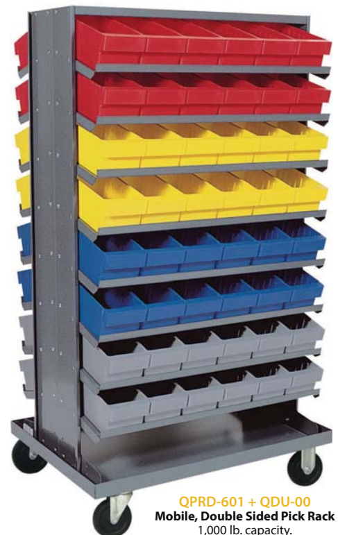
QPRD-601 + QDU-00 Mobile, Double Sided Pick Rack 1,000 lb. capacity.