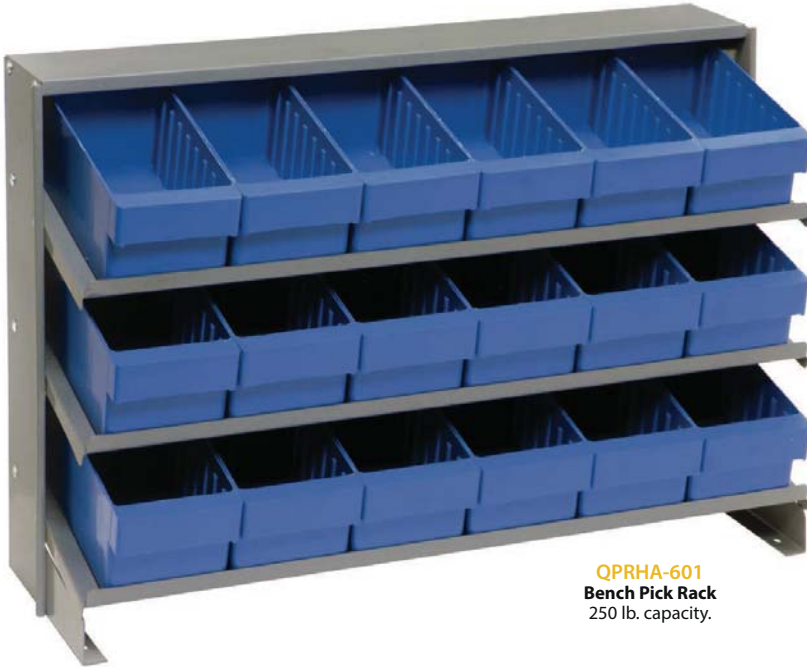
QPRHA-601 Bench Pick Rack 250 lb. capacity.

Sturdy steel racks with Super Tuff Euro Drawers create an efficient flow rack. Sloped shelving provides easy access to stored items. Drawers can be removed from racks easily. These gray baked enamel, free standing racks assemble easily. Mobile unit has a 1,000 lb. capacity and is equipped with 2 swivel, 2 rigid casters. Drawers are available in 4 colors. One bin color per system.