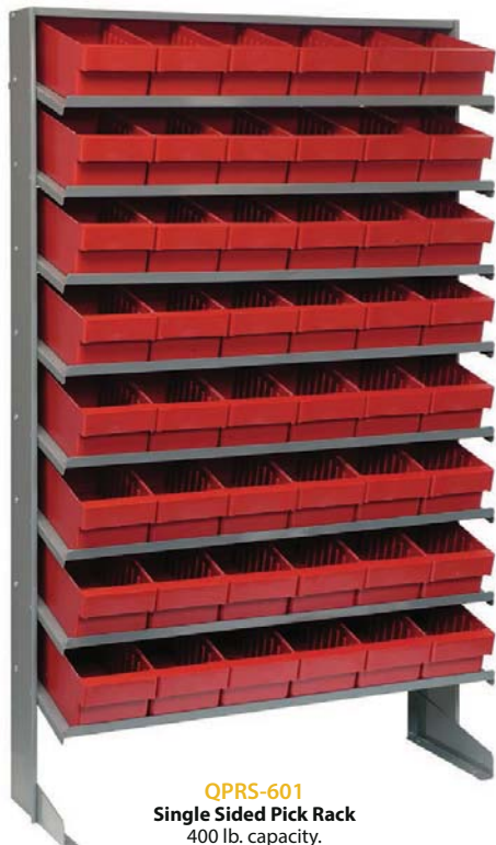
QPRS-601 Single Sided Pick Rack 400 lb. capacity.