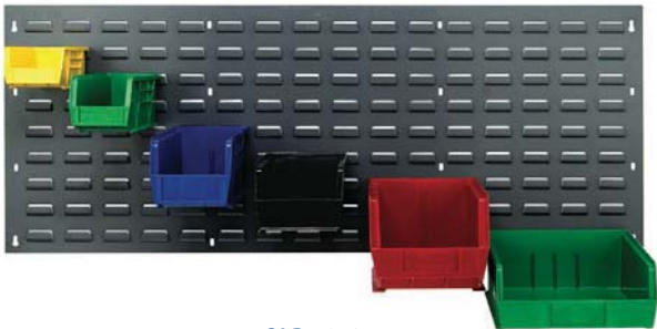
QLP-4819 48"L x 19"H Accepts all sizes of Ultra Bins. 250 lb. load capacity. (Bins sold separately)