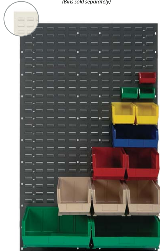
QLP-3661 36"L x 61"H Accepts all sizes of Ultra Bins. 1,000 lb. load capacity. (Bins sold separately)