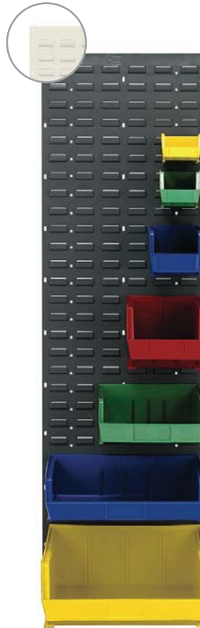
QLP-1861 18"L x 61"H Accepts all sizes of Ultra Bins. 500 lb. load capacity. (Bins sold separately)