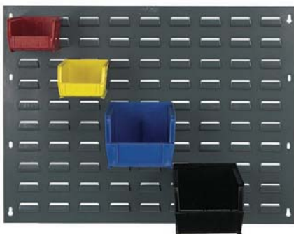
QLP-2721 27"L x 21"H Accepts all sizes of Ultra Bins. 175 lb. load capacity. (Bins sold separately)