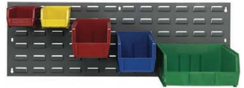
QLP-3612 36"L x 12"H Accepts all sizes of Ultra Bins. 175 lb. load capacity. (Bins sold separately)