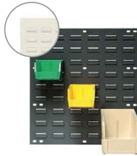
QLP-1819 18"L x 19"H Accepts all sizes of Ultra Bins. 175 lb. load capacity. (Bins sold separately)