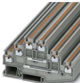
Multi-level terminal block, Cross section: 0.14 mm 2 - 1.5 mm 2 , AWG: 26 - 14, Connection type: Push-in connection, Width: 3.5 mm, Color: gray, Mounting type: NS 35/7,5, NS 35/15

Please be informed that the data shown in this PDF Document is generated from our Online Catalog. Please find the complete data in the user's documentation. Our General Terms of Use for Downloads are valid ( http://phoenixcontact.com/download )