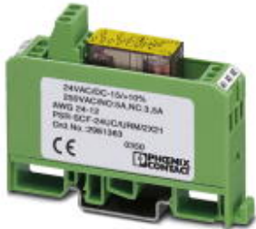
Universal safety relay with forcibly guided contacts, two PDT contacts, for U_N 120 V AC/DC

Please be informed that the data shown in this PDF Document is generated from our Online Catalog. Please find the complete data in the user's documentation. Our General Terms of Use for Downloads are valid ( http://phoenixcontact.com/download )