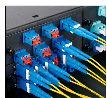
LC Duplex Adapter Blockout Device (PSL-LCAB)