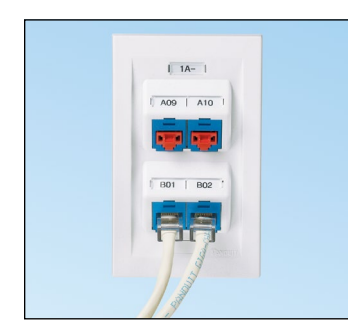
RJ45 Jack Blockout Device (PSL-DCJB)

Panduit offers various physical network security products for both copper and fiber applications: