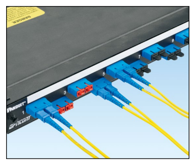
To install: Snap the blockout device into the SC Adapter.