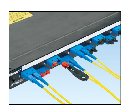
To remove: Retract the device.