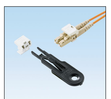
LC Duplex Lock-In Clip (FLCCLIW-X)

PANDUIT CANADA Markham, Ontario cs-cdn@panduit.com Phone: 800.777.3300