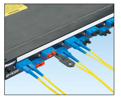
To release: Insert the removal tool, which attaches to the blockout device.