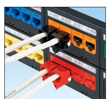
RJ45 Plug Lock-In Device (PSL-DCPLX)