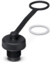
M12 sealing cap with fixing band, for free M12 sockets with 14.5 mm fastening eye

Please be informed that the data shown in this PDF Document is generated from our Online Catalog. Please find the complete data in the user's documentation. Our General Terms of Use for Downloads are valid ( http://phoenixcontact.com/download )