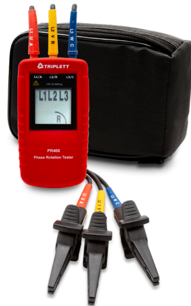
Motor and Phase Rotation Tester