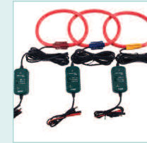
Model PQ34-30 3000A (24"/600mm) Flexible Current Clamp Probes for wrapping around busbars