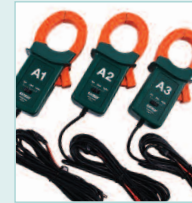
Model PQ34-12 1200A Current Clamp Probes with 2" (50mm) jaw size