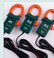
Model PQ34-12 1200A Current Clamp Probes with 2" (50mm) jaw opening