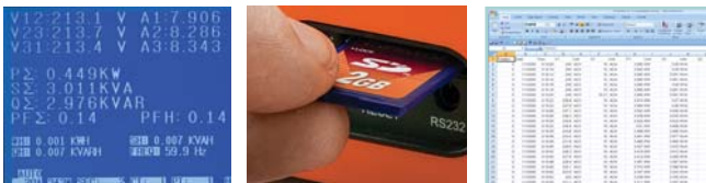
Backlit LCD displays numerical values. The data can be stored in SD memory card (included) and then transferred from meter to PC using Excel ® software and datalogged readings.

Complete with 4 voltage leads with alligator clips, 8 AA batteries, SD memory card, Universal AC adaptor (100 to 240V), and case. Clamp probes sold separately.