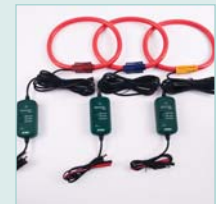
Model PQ34-30 3000A (24"/600mm) Flexible Current Clamp Probes for wrapping around busbars