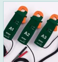
Model PQ34-2 200A Current Clamp Probes with 0.8" (19mm) jaw opening

Choose the best clamp probes to fit your application needs ranging from 200A to 3000A and flexible vs traditional jaw type.