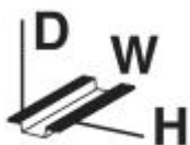
Figure shows PLC-BSC-120UC/21-21/SO46 version

14 mm PLC basic terminal block for high continuous currents with push-in connection, without relay or solid-state relay, for mounting on DIN rail NS 35/7,5, 1 PDT, input voltage 24 V DC