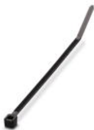
Cable tie, resistant to UV rays, dimensions: L x W, 370 x 4.8 mm, color: black

Please be informed that the data shown in this PDF Document is generated from our Online Catalog. Please find the complete data in the user's documentation. Our General Terms of Use for Downloads are valid ( http://phoenixcontact.com/download )