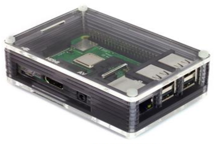
PIM 340- Ninja