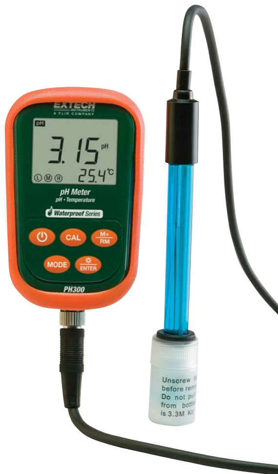
Large blue backlit dual LCD display with calibration and memory indicators