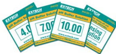
PH103 includes 6 pouches each of pH 4, pH 7, and pH 10 Buffers plus 2 Rinse solutions