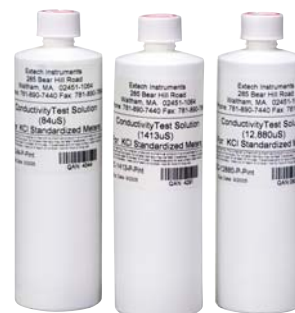
EC-84-P, EC-1413-P, and EC-12880-P pint size conductivity standards