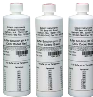
Pint size pH buffers for pH 4, 7, and 10 available (PH4-P, PH7-P, PH10-P)