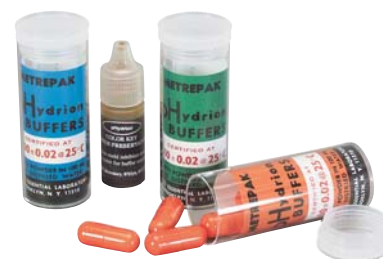
650470 pH 4, 7, and 10 buffer capsules with color key preservative