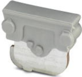
Feed-through connector, Length: 10.5 mm, Width: 4 mm, Color: gray

Please be informed that the data shown in this PDF Document is generated from our Online Catalog. Please find the complete data in the user's documentation. Our General Terms of Use for Downloads are valid ( http://phoenixcontact.com/download )