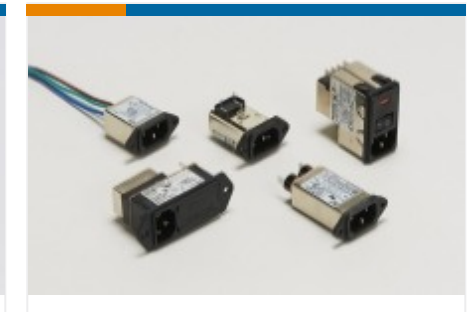
Multi-Function Inlet Filters (368)