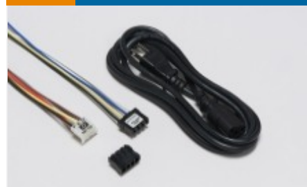
Filter Accessories (4)