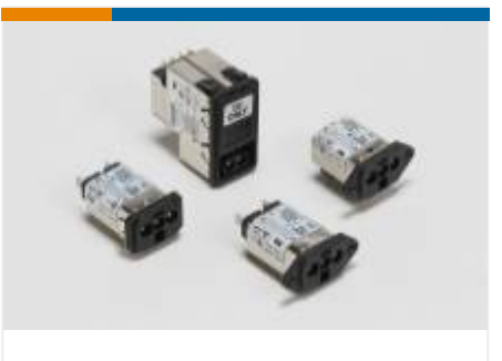
DC Filters (12)