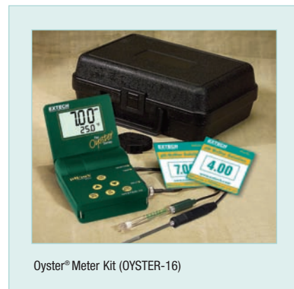
Oyster® Meter Kit (OYSTER-16)