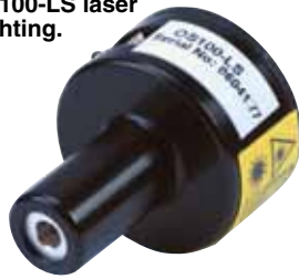
OS100-LS laser sighting.