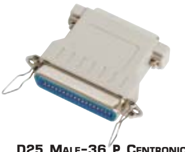
D25 MALE-36 P CENTRONICS