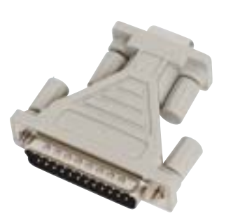
D9 FEMALE-D25 MALE