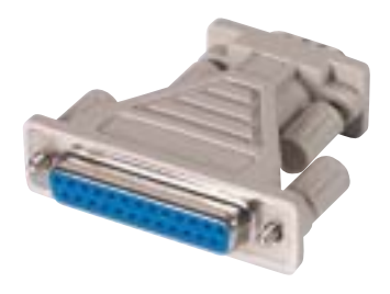
D9 Male-D25 Female