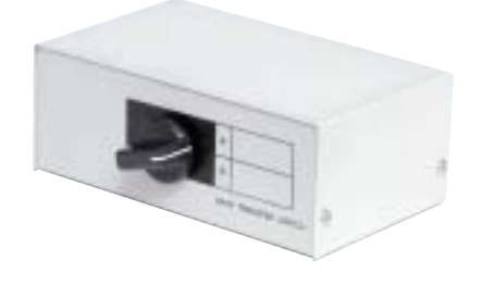
D25 A-B SWITCH BOX