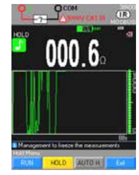
HOLD Management and hold of the display