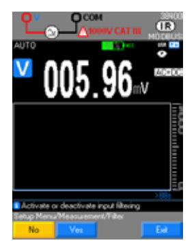
Measurement Configuration of the measurement parameters