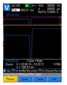
MEM Storing of the measurements, recording mode