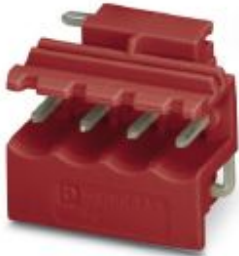
PCB headers, pin layout: Linear pinning

Please be informed that the data shown in this PDF Document is generated from our Online Catalog. Please find the complete data in the user's documentation. Our General Terms of Use for Downloads are valid ( http://phoenixcontact.com/download )