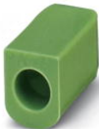
Keying cap, for forming sections, plugs onto header pin, green insulating material

Please be informed that the data shown in this PDF Document is generated from our Online Catalog. Please find the complete data in the user's documentation. Our General Terms of Use for Downloads are valid ( http://phoenixcontact.com/download )