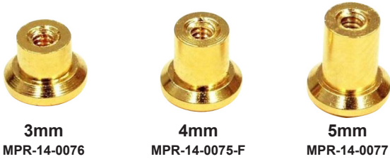
3mm MPR-14-0076 4mm MPR-14-0075-F 5mm MPR-14-0077