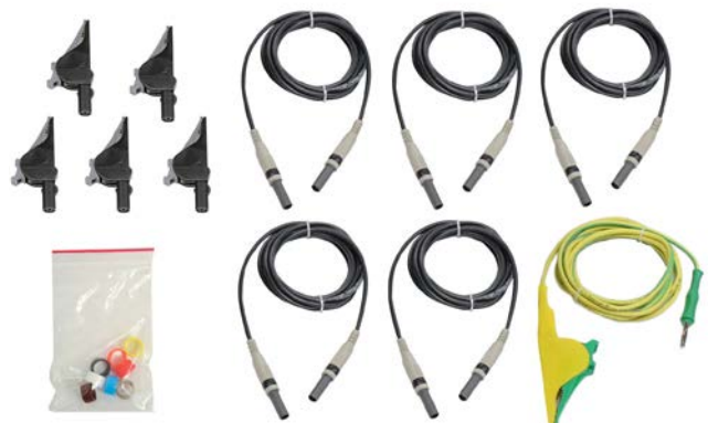
MPQ1000 Voltage Lead Set (2007-259)