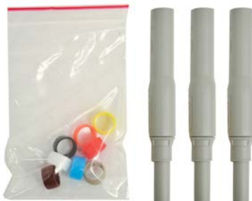
Optional Fuse Adapter Kit (1008-645)

Includes 4 adapters with multiple color straps.