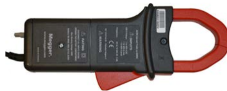
Hall Effect Current Clamp 600 A dc and 400 A ac (CP-600DC-ID)