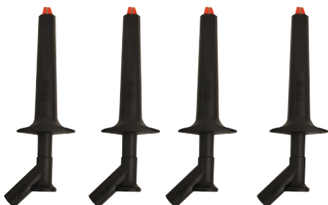
Optional Plunger Clips (1008-756)