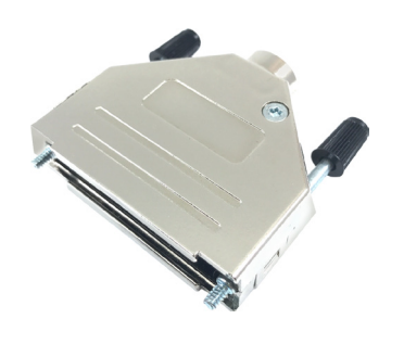
D-Sub Connector with Backshell