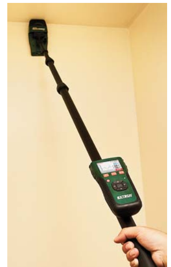
Wireless sensor affixes to telescoping handle