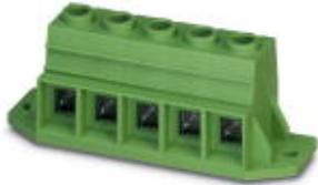
The figure shows a 5-pos. version of the product

Please be informed that the data shown in this PDF Document is generated from our Online Catalog. Please find the complete data in the user's documentation. Our General Terms of Use for Downloads are valid ( http://phoenixcontact.com/download )