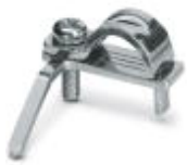
Shield connection clip for printed circuit terminal block

Components of electronic housing - ME-SAS - 2853899