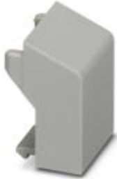
DIN rail housing, Filler plug for unoccupied terminal points, color: light gray (7035)

Please be informed that the data shown in this PDF Document is generated from our Online Catalog. Please find the complete data in the user's documentation. Our General Terms of Use for Downloads are valid ( http://phoenixcontact.com/download )