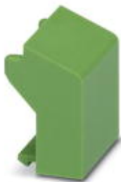
Filler plugs, for unoccupied terminal points

Please be informed that the data shown in this PDF Document is generated from our Online Catalog. Please find the complete data in the user's documentation. Our General Terms of Use for Downloads are valid ( http://phoenixcontact.com/download )