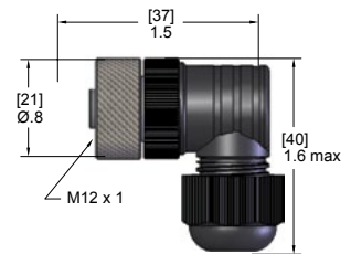
Female Right Angle