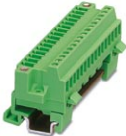
The illustration shows a 16-position version

Please be informed that the data shown in this PDF Document is generated from our Online Catalog. Please find the complete data in the user's documentation. Our General Terms of Use for Downloads are valid ( http://phoenixcontact.com/download )