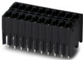
The figure shows a 10-pos. version with 20 contacts

Please be informed that the data shown in this PDF Document is generated from our Online Catalog. Please find the complete data in the user's documentation. Our General Terms of Use for Downloads are valid ( http://phoenixcontact.com/download )