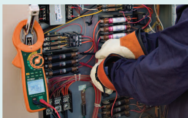
Test leads included for Multimeter functions