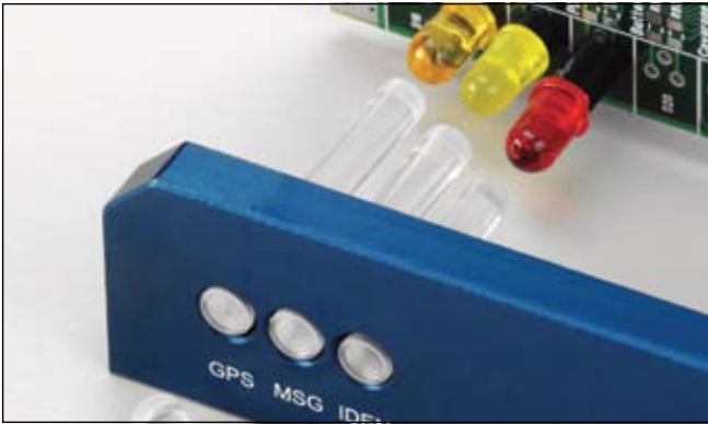
U.S. & Foreign Patents Issued and Pending