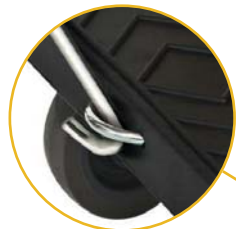
ATTACHED PULL RING allows dolly to be pulled with ease