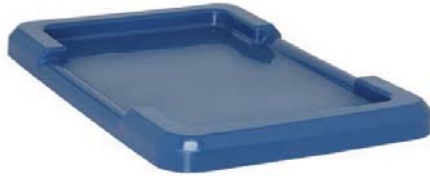
LID2516-8 Optional lid keeps stored items dust free. Tubs can still stack or cross stack with lids in place.