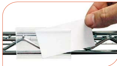
Inserts slide into label holders easily