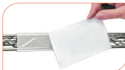
LHE3X5C Label holder extender requires clear label holders listed above. Works with all sizes.

Clear label holder extender with inserts converts 1-1/4"H labels shown above into a 3" x 5" label. Labels can be easily changed or relocated. Laser and inkjet compatible inserts come in 8-1/2" x 11" perforated sheets. Package of 12.