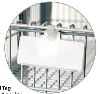
PS-LH3 Hanging Label Tag Fits 1-3/8" x 3" Adhesive Label