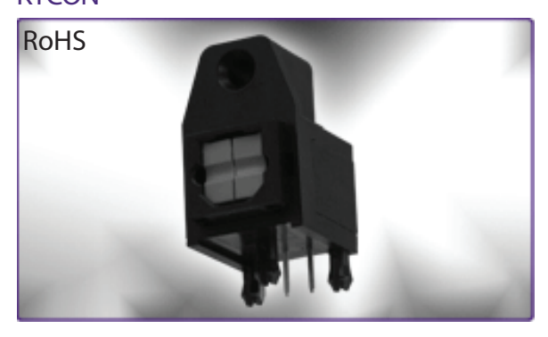
KFOX Series Optical Audio Jack With Mounting Tab and Split Gate