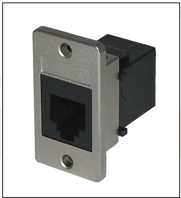
RJ12 6p6c Keystone Panel Mount Coupler (KCK66pm)