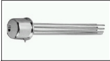
JMSWD - 12XM (4 - 1617351 - 6)