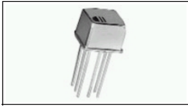
JMGSCD - 6PW (1 - 1617150 -9)