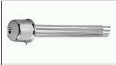
JMAC - 5XLS (1 - 1617121 -5)