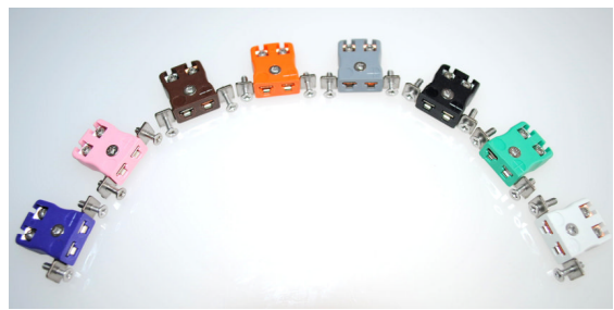
'IEC Colour coded'

About Labfacility Formed in 1971, Labfacility specialize in the field of Temperature and Process Measurement.