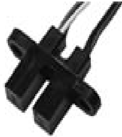
HOA Series IR Opaque Optoschmitt Sensor, Transistor Output, Two Mounting Tabs, Plastic Package