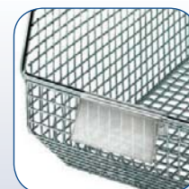
Shown with optional HBL3C Clear Label Holder Fits 1-1/8" x 3" Label (Sold separately)

INSTANT VISIBILITY NO DUST OR DIRT BUILDUP ALL WELDED