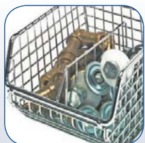
Shown with optional Divider (Sold separately)