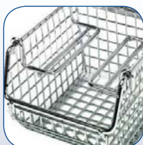
Shown with optional Side Stacking Hangers (Sold separately)